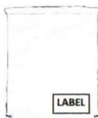
Item: Valuables Bag Position: Bottom left of bag