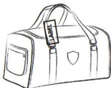
Item: Locker bag with logo Position: Handle of bag