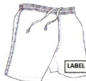
Item: PE & Rugby Shorts Position: Bottom left leg