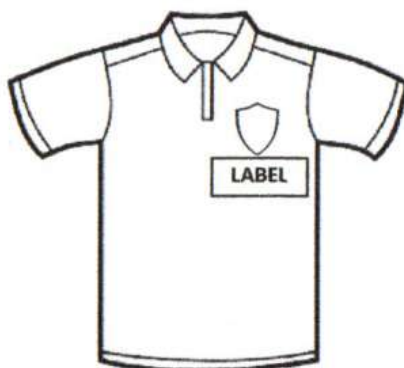
Item: Polo/Cricket Shirt with logo Position: Left breast under logo