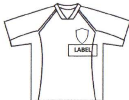
Item: Rugby Jersey with logo Position: Left breast under logo