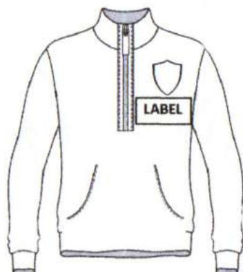
Item: Midlayer Position: Left Breast under logo