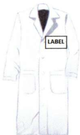
Item: Laboratory Coat Position: On Left Breast